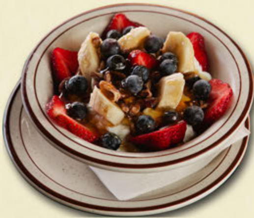
AUTHENTIC GREEK YOGURT TOPPED WITH FRESH STRAWBERRY, BANANA, BLUEBERRIES, PECANS & HONEY...8.95